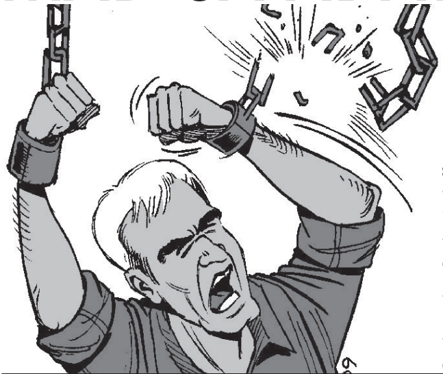
Cartoon by Carlos Latuff

Sa'adat has become a national Palestinian symbol of prisoner steadfastness, through his rejection of Israeli military courts and leadership in the prisoners' movement.